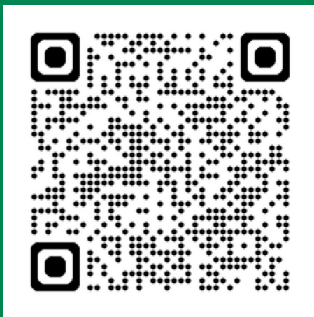
Our new Website QR CODE

Thank you to everyone in our community who continues to support Hatfield Foodbank — we could not do this without you.