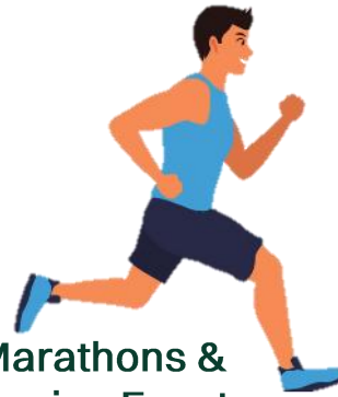
Marathons & Running Events